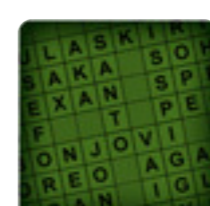
Point and Solve